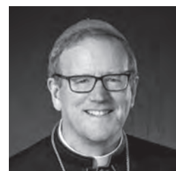
Bishop Robert Barron